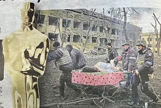
AP/FRONTLINE Ukrainian emergency workers and volunteers carry an injured pregnant woman from a maternity hospital damaged by an airstrike in Mariupol, Ukraine, March 9, 2022. The woman was taken to another hospital but did not survive. Still from FRONTLINE PBS and AP's feature film "20 Days in Mariupol."