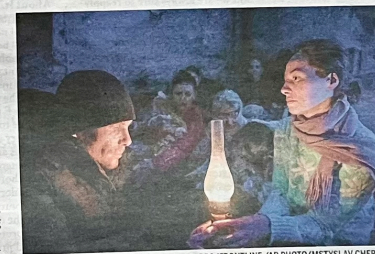
People take shelter in a youth theater in Mariupol, Ukraine, as seen in "20 Days in Mariupol."